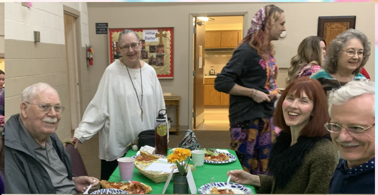
A light lunch is enjoyed each Sunday following HCC's service